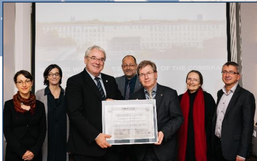
26/10/17: University of Cologne, new CG member