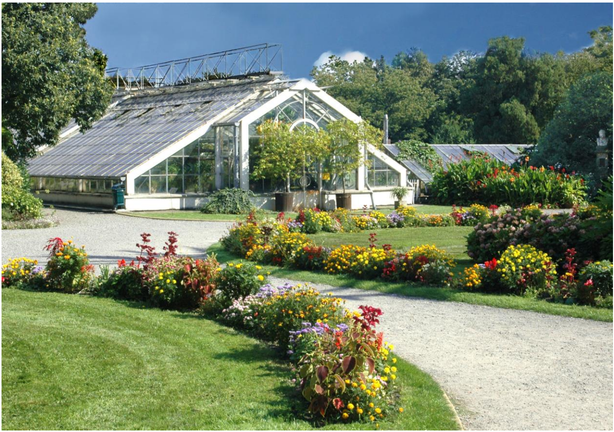
"Victoria" glass house

The collection of tropical plants is kept in three glasshouses: