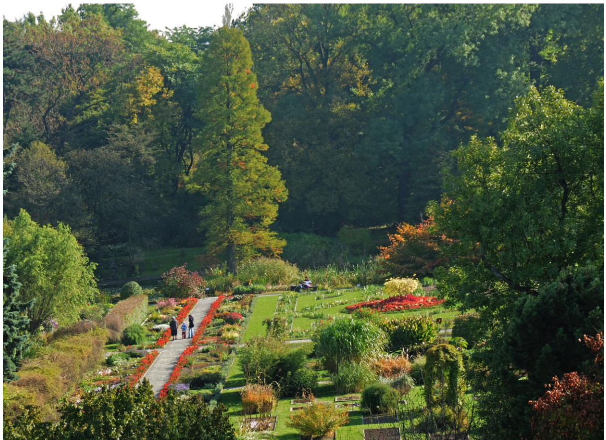
Front part of the Garden, view from the Śniadecki Collegium

Year of foundation: 1783 Geographical location: latitude 50°04' N, longitude 19°58' E; altitude 201 - 208 m n.p.m. Area: 9.6 ha Time of opening: April – October, 9.00 - 19.00; Greenhouses: 10.00 - 18.00, except on Fridays. Museum opening hours: Wednesday, Friday: 10.00-14.00, Saturday: 11.00-15.00