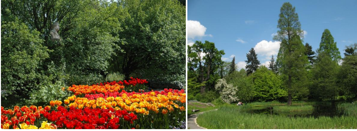
Józef Warszewicz monument among tulips

Address: 31-501 Kraków, ul. Kopernika 27 tel. (+4812) 421 26 20, (+4812) 663 36 35 e-mail: hortus@uj.edu.pl More information : <u>www.ogrod.uj.edu.pl</u>