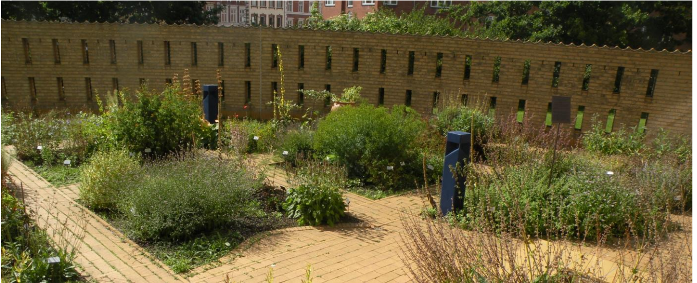
Western part with herb beds