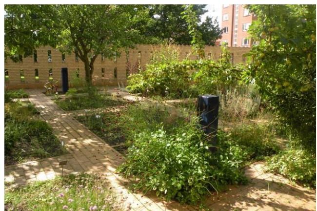
Bottom: view to the south

The Steno Museum organises guided tours to the herb garden for groups and holds exhibitions on the history of science and medicine.