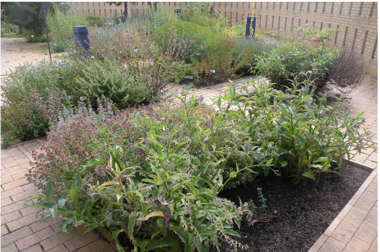
Western part of the herb garden

The Steno Museum's south-facing patio is laid out as a historical medicinal herb garden. It contains more than four hundred species, all with a history as medicinal plants in Denmark or abroad. Part of the garden has been arranged in accordance with the manual on medicine by Henrick Smid in 1546, En skøn lystig ny Urtegaardt ("A Fair and Vibrant New Herbal Garden"). The book describes around 220 plants, a mix of wild and cultivated plants together with the ailments for which they are suited and the ways in which to use them, i.e. either internally or externally. The manual includes a supplement on the preparation of concoctions, oils, etc., to be used for the treatment of ailments. The preface to his manual was written by one of Henrick Smid's friends, Christian Torkelsen Morsing, the first professor of medicine at the University of Copenhagen.