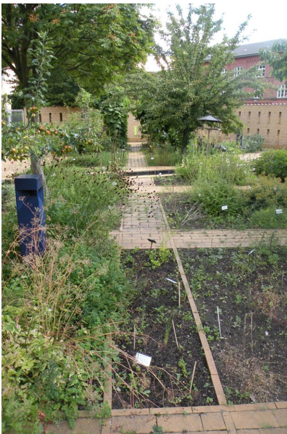
The garden from the west