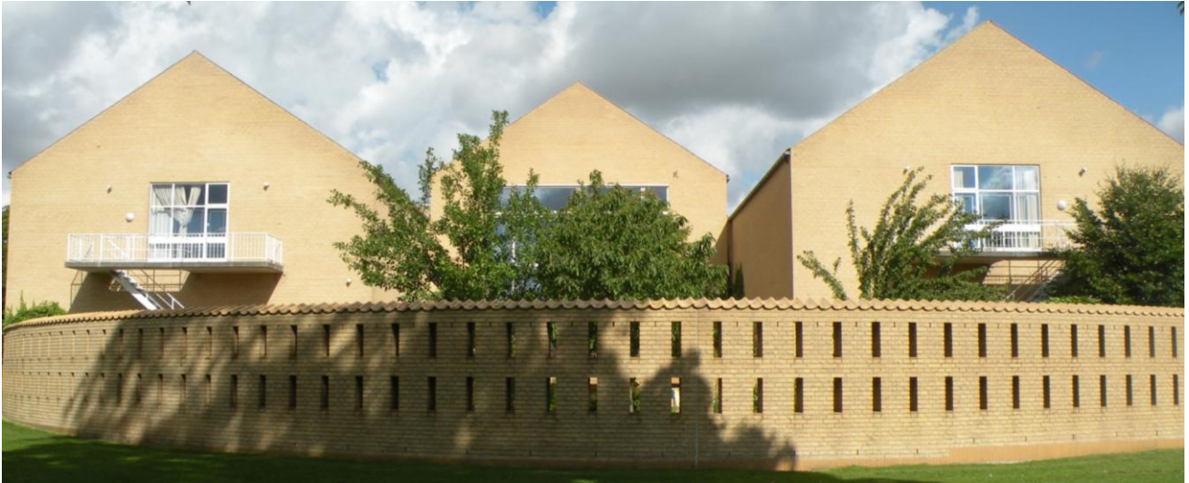
Garden wall with the Steno Museum behind