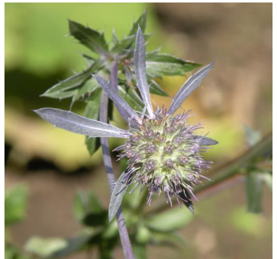
Sea holly (Eryngium planum)