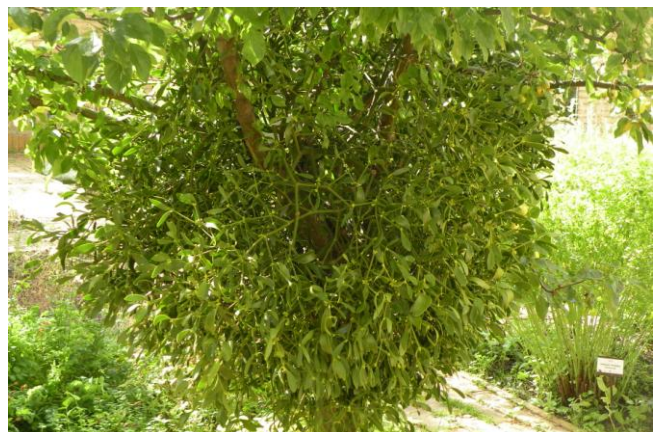
Top: the mistletoe