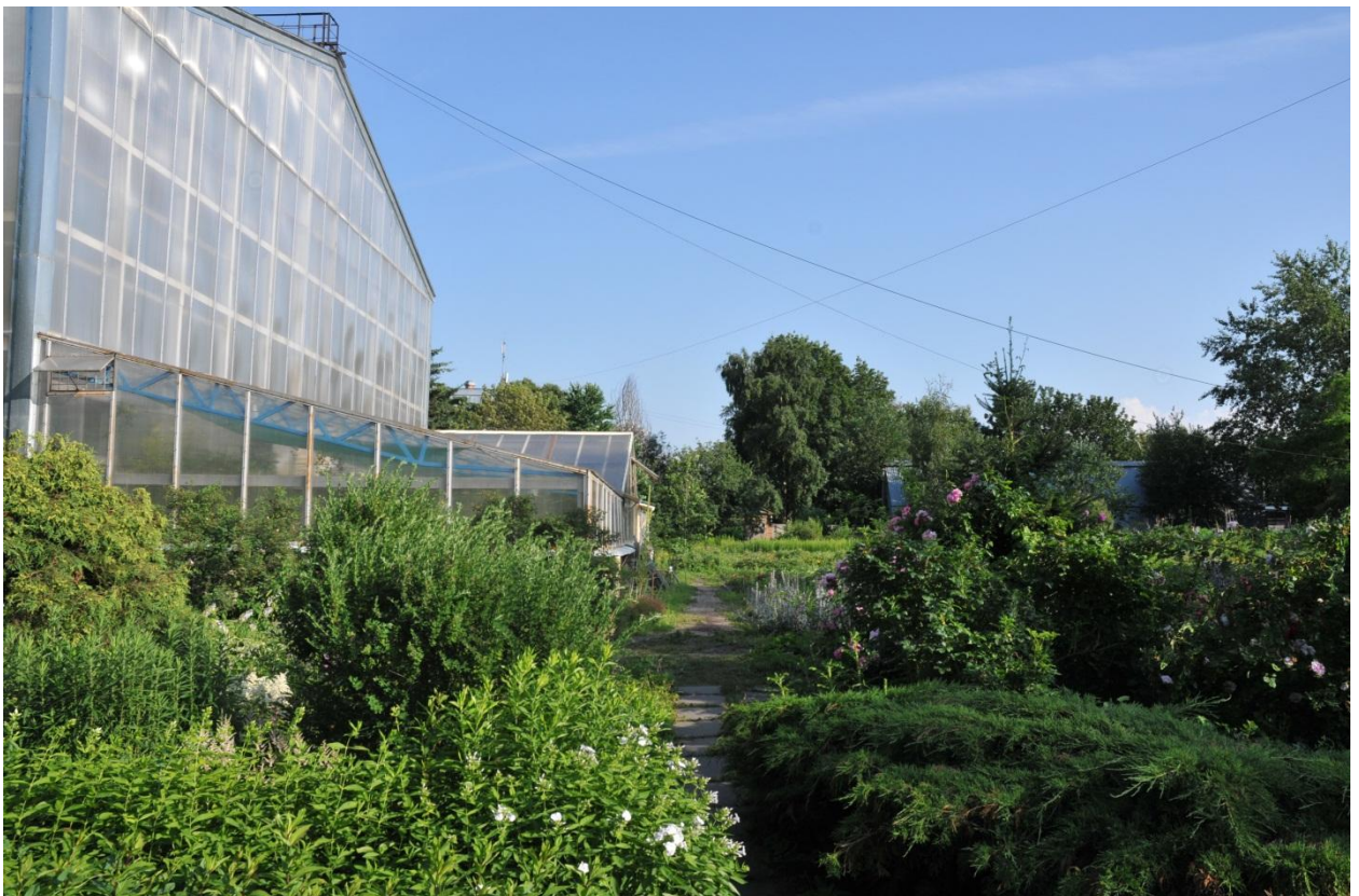
The large Palm House

Restoration after WW II was mainly accomplished by 1950 and turned into a continuous expansion of the Garden’s collection and facilities such as the new large greenhouse for palms constructed in 1974.