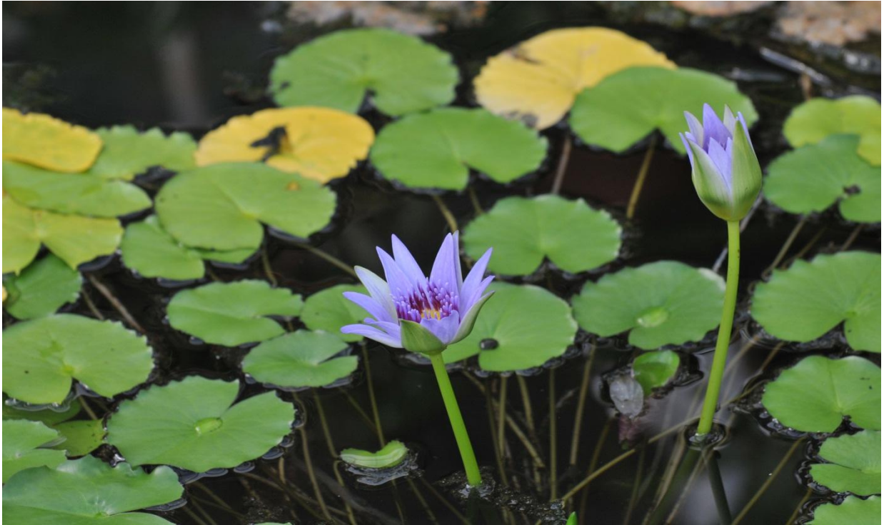
Water Lily (Nymphaea sp.)