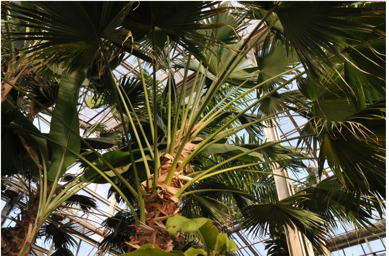
The Palm House

As 150 years ago, today the Garden still maintains its double function of both study and research department.